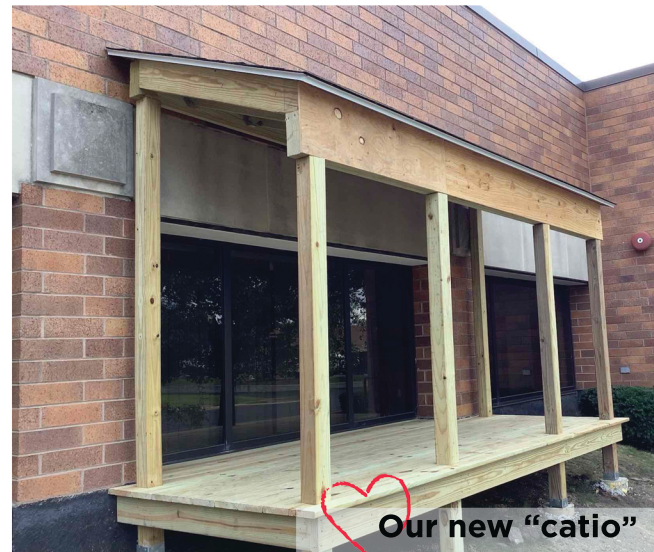
Our new "catio"

With this new chapter in Heartland's story of life-saving, comes a renewed opportunity to reconnect with our community and our values. In addition to the new space, we are prioritizing our Medical and Wellness capacity through renovations to enhance enrichment and provide life-saving care. We are also prioritizing our Development and Community Outreach capabilities so that we can better serve those who support us and our animals and to be a cornerstone of animal welfare.